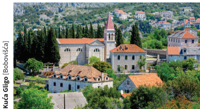
Kuća Gligo [Bobovišća]

🏠 Kuća Gligo [Bobovišća] smještena je na zapadnoj strani sela, prema luci Bobovišće, drugo je reprezentativno zdanje kasno-baroknog klasicizma. Sagrađena je u prvoj polovini 19. stoljeća. Kuća Gligo je svojom veličinom i oblikom jedan od najljepših primjera arhitekture toga vremena.