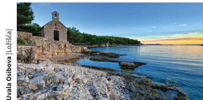
Uvala Osibova [Ložišća]

📍 Uvala Osibova smještena je na jugozapadu Brača. Ovo je uvala koju definitivno trebate posjetiti. Osibova - crkva sv. Ivana Krstitelja iz 14. st., crkva sv. Josipa iz 19. st i XIV postaja križnog puta koje su kao male kapele sagrađene početkom XVIII. st. od Milne do uvale Osibova.