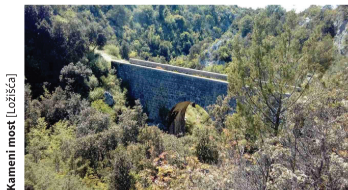
Kameni most [Ložišća]

🗨️ Kameni most [Ložišća] izgrađen je u vrhu Velikog dolca – klanca po kojem je, pretpostavlja se, nekad tekla rijeka Elafuza ili po drugima Bretanida. Za austrijske uprave na otoku podignut je veliki most – svojevrsan kuriozitet na ovom danas bezvodnom otoku. Od milja Bračani most zovu “Most Franje Josipa”.