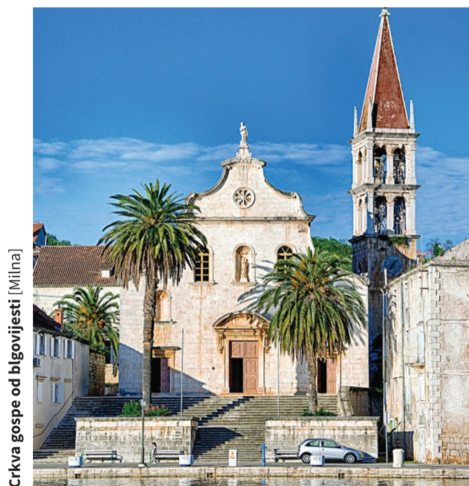
Crkva gospe od blagovijesti [Milna]

🏰 Crkva gospe od blagovijesti [Milna] sagrađena je 1783. g u baroknom stilu. Crkvu krase bogato pročelje i kamene skale koje vode do crkve. Visoki kameni zvonik stariji je od same crkve sagrađen u 16. stoljeću. U sklopu ove crkve nalazi se i sakristija, prvotna crkva u Milni sagrađena 1519. g.