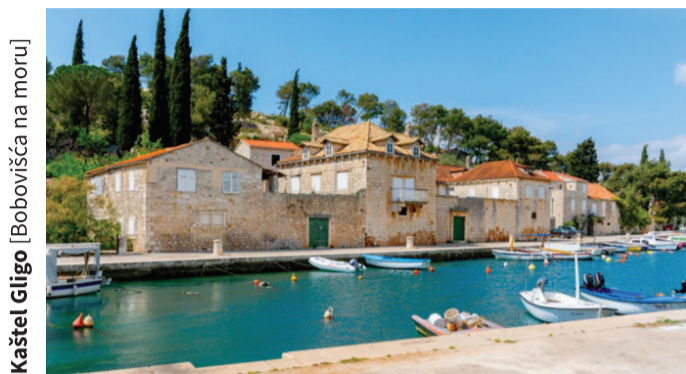
Kaštel Gligo [Bobovišća na moru]

🏰 Kaštel Gligo ( nepokretno kulturno dobro ) [Bobovišća na moru]. Tri krila sklopa nastala su oko prostranog dvorišta prema moru ograđenog visokim obrambenim zidom uz kojeg je dijelom sačuvana kamena šetnica na svodovima. Na istoku je četvrtasta jednokatnica istaknuta od zatvorenog perimetra dvorišta sa nizom puškarica u prizemlju koja je pripadala baroknom dijelu utvrđenog sklopa. Kaštel obitelji Marinčević-Gligo, koja se javlja koncem XVII. st., vrijedan je utvrđeni barokni sklop za obranu luke i pristupa u unutrašnjost otoka Brača.